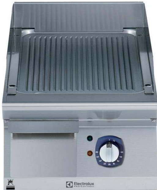
371332 (E7IILDAOMCA) Half module electric Fry Top with ribbed brushed chrome cooking Plate, sloped, thermostatic control, scraper included